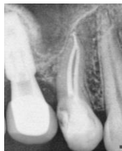
Canal morphology lacking clarity