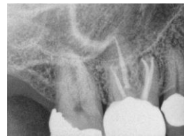
Locating and obturating the second mesio-buccal canal

All patients will be initially assessed at a consultation to ensure that the diagnosis, prognosis and treatment options are discussed prior to undertaking any treatment.